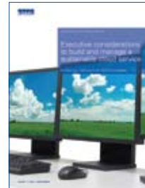
Executive Considerations to Build and Manage a Sustainable Cloud Service

Visit www.kpmg.com/ess to download these publications.