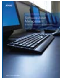
Software Asset Management—a key to infrastructure optimization