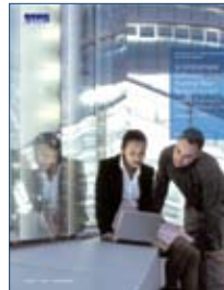
Is unlicensed software usage hurting your bottom line?